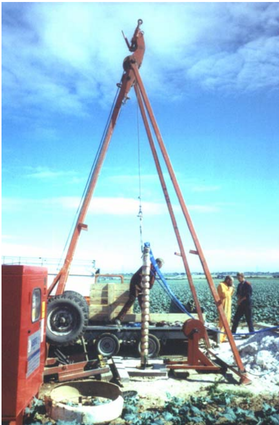
Photos above : Birchington, Kent, UK. Cover photo : Atacama Desert, Chile.